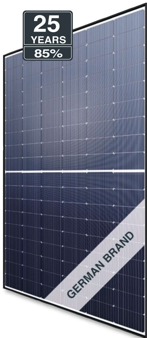
Fig. similar 108MHAUS210726A

High quality junction box and connector systems